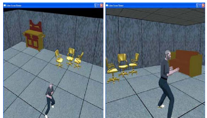
Figure 3 Created Scenes

The example shows how a scene could be developed with the use of a witness and a system expert who would utilise the software. First, measurements and photos of the scene were taken. The textures used on the floor, wall and ceiling tiles were created directly from these photos and incorporated into the system. Next, the chair and wall cabinets were modelled in 3D Studio Max. Finally, the character was developed. In this case they were made from photographs taken of a real person, although it is not always possible to get this amount of detail about suspects. It could be feasible to develop the characters in a similar way to current photo fit images, but this was beyond the scope of this project. Once the basic scene has been created, the witness of the crime could sit in with the software user and describe the witnessed crime, in this case one person kicking another person. Animations are developed until the user is happy with the sequence of events and the characters are incorporated into the scene. Finally, the scene is rendered and viewed from multiple angles – including the point of view from the witness.