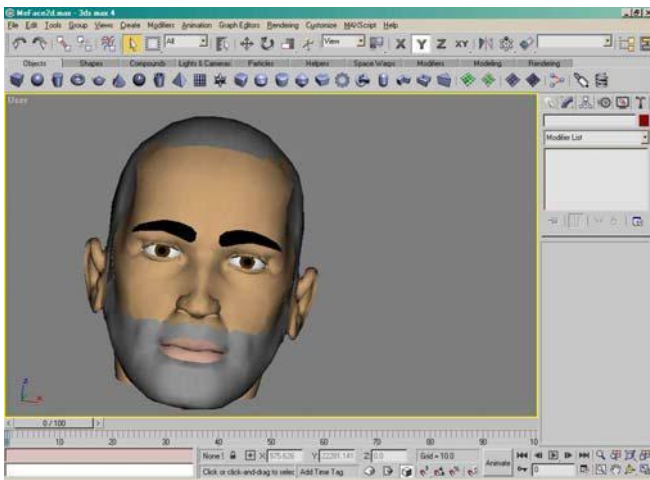
Figure 2 Character Developments

spherical object made up of 128 faces), which was placed over the guidelines and cut down the middle to produce a semi sphere. This was done as it is more efficient to only model half the head as once it is completed it can be mirrored to produce the complete head. The exosphere was manipulated to the shape of the head by moving, adding, and dividing faces. Making complex elements such as the mouth, eyes and ears proved to be very time consuming. Because of the 3D nature of the object being modeled, and only having a 2 dimensional image on the screen it can be difficult to know exactly where a point is being moved. It is possible to use a multiple panel view that shows the object from four different perspectives; however, with the limited screen size it is a trade off between scale and perspective (Burford & Blake 2001).