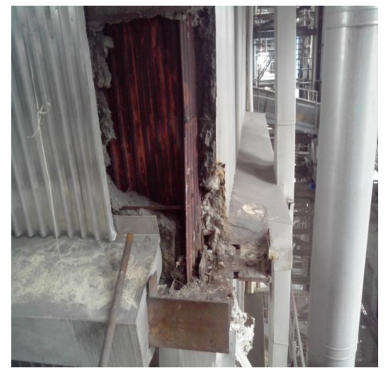
The total uninsulated area is 50sqm and the surface temperature is 400°C. The uninsulated areas cause surface heat loss. It requires insulation where