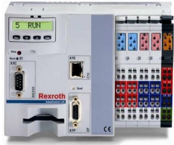
Fig 2. Rexroth Indra Works PLC kit

The developed program can be executed and tested online with the help of "Simulation Mode" feature provided within the IndraWorks PLC.