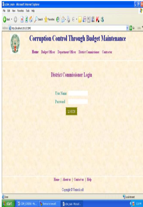
Viewing Distirct commissioner officer page: