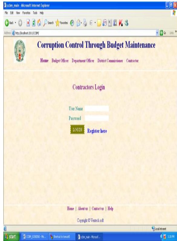
Viewing Contractor page: