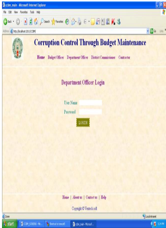
Viewing Department officer page: