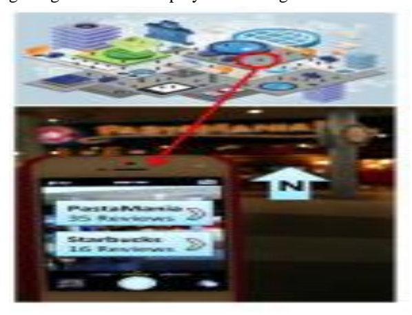
Fig.1 Application of IntelligShop

some retailer catalog; instead she just simply raises the phone camera against the retailer for immediately getting its reviews displayed at the right location.