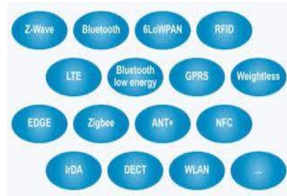
Fig 7. Different technologies

architecture can be used in this concept. As SOA approach applications are running on static computers, it requires adaptive to various context. Normally SOA can be deployed on three layers. Each layer participating for different functionalities in the IoT.