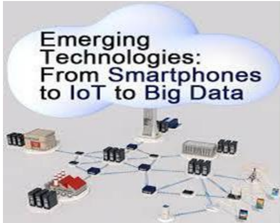
9. Smartphones to Big Data

mechanisms. IoT services and data are running the dynamic environment, so the objects are presented in the IoT may be appear or disappear at any time. To this survey aims to avoid the interruption and to provide the security of IoT data using security algorithms to reduce the security threats in the network.