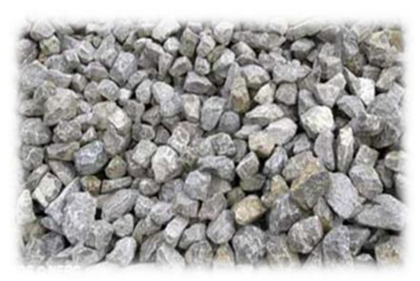
Figure 3.3 Coarse aggregate