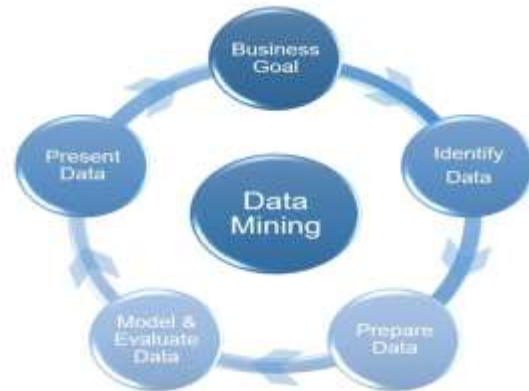
Figure 1: Data Mining [3]

policies, even medical diagnosis and many other applications, extracting the valuable data, it necessary to explore the databases completely and efficiently.