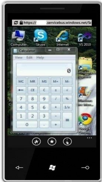
Fig 1.Screen access in Windows Phone

So far application was tested with Google chrome, Internet Explorer (IE), android, Windows Phone 8, iPhone, Firefox.