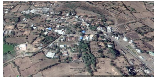
Population of suvali Beach

Suvali village is situated at Hazira, Taluka Choriyasi, District Surat. This village does have a small population of around 560. This village is not more developed though having small primary school and dispensary. Around % of land is available for agriculture near the Suvali village some factories or companies were there. Suvali village located at the 31 kilometers from the Surat.