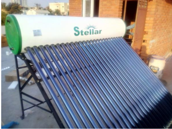
Fig. 3.1 Evacuated Tube Collectors (ETC) based Solar Water Heaters

(c) Fire Tube Boiler- Fire tube is a type of a boiler which uses hot gases to pass through one or more tubes. This tubes consist of flowing water. The walls of tubes are heated by surrounding of hot gases which heat the water to 120°C . At 120°C water converts to steam which is utilized for cooking purpose.