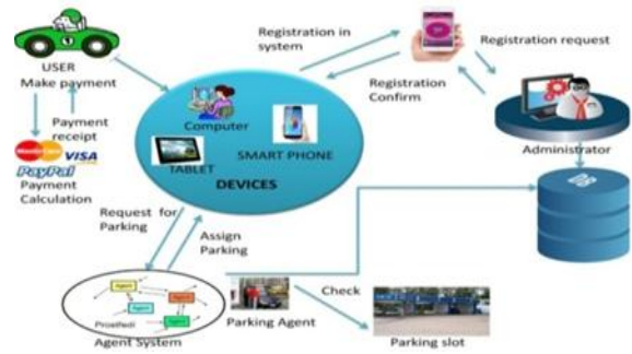
Figure 3 System Architecture

The system architecture shows the three main components Parking zone, user and admin. As a result, the state of parking resources is changed by users parking choice. The management system i.e. receiving and assigning parking to users is handled by agent. Here agent works as a broker. The management system shows live parking availability information to users (also drivers). Upon receiving parking information, the user selects desired parking slot and reserves a space. User can have their username, login id, phone number, email and address. User can make payment online. Admin can collect the whole data from database system.