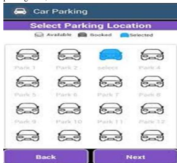
Figure 5 Expected Result

the system is an efficient online vehicle parking system. The successful implementation of this system incorporates of assigning the free parking slot to the vehicle. Also all the information about the parking area, slots, allotment and de-allotment is provided on web portal. If the parking space is full, no vehicle is allowed to enter the parking space until any of the parking slots, is made available.