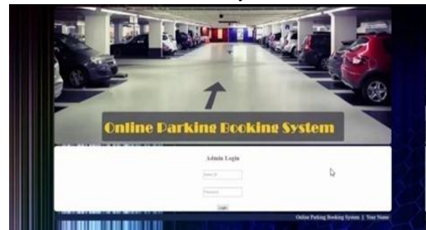
Figure 4 Searching Screen

The system architecture shows the three main components Parking zone, user and admin. As a result, the state of parking resources is changed by users parking choice. The management system i.e. receiving and assigning parking to users is handled by agent. Here agent works as a broker. The management system shows live parking availability information to users (also drivers). Upon receiving parking information, the user selects desired parking slot and reserves a space. User can have their username, login id, phone number, email and address. User can make payment online. Admin can collect the whole data from database system.