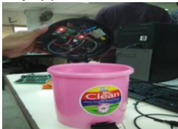
Fig 2. Prototype model

In this paper, we use GSM modem to send the messages. It comprises of a GSM/GPRS modem with standard correspondence interfaces like RS-232 (Serial Port), USB, so it tends to be effectively associated with different gadgets. There are three LEDs that show three unique dimensions of stature of the loss in the canister. The green one shows that receptacle is unfilled and the red one demonstrates the container is full. At the point when the receptacle is full the ringer that is prepared, signals for multiple times with the goal that not any more waste is arranged into the canister. Along these lines, we can control the over streaming receptacles. At that point client will get a message saying that the dustbin must be arranged. This message is sent utilizing the GSM modem. The message can be sent to various individuals in the meantime. Figure 2 demonstrates the model that is created. Figure 3 demonstrates the message displayed.