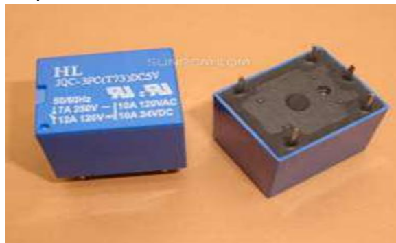
Fig 3.4: Relay

A relay is an electrically operated switch. Relays are used where it is necessary to control a circuit by a separate low-power signal. A relay with calibrated operating characteristics and sometimes multiple operating coils are used to protect electrical circuits from overload. As shown in above figure raspberry pi is connected to the devices via relay. Here relay can be operated as switch to on or off the devices.