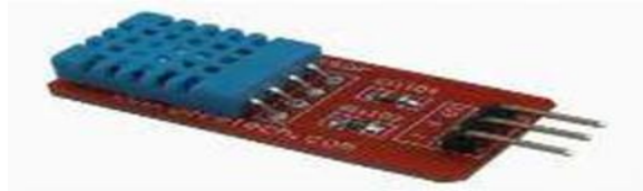
Fig 3.2.2: DHT 11(Temperature Sensor)