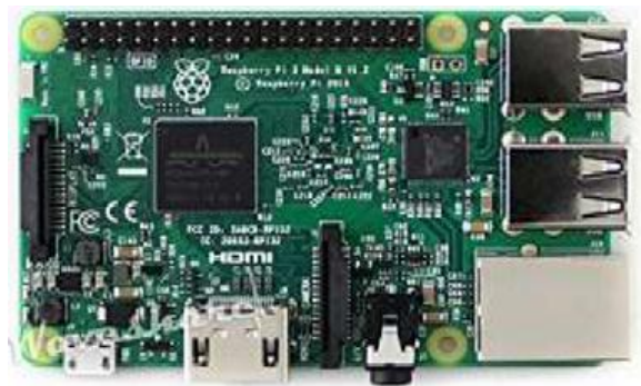
Fig 3.3: Raspberry Pi Model

Raspberry Pi is a small sized single board computer which is capable of doing the entire job that an average desktop computer does like spread sheets, Word processing, Internet, Programming, Games etc. It contain 1GB RAM, 2 USB, ARM V8 Processor and an Ethernet port, HDMI & RCA ports for display, 3.5mm Audio jack, SD card slot (bootable), General purpose I/O pins, runs on 5v.