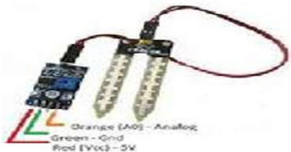
Fig 3.2.1: Soil Moisture Sensor