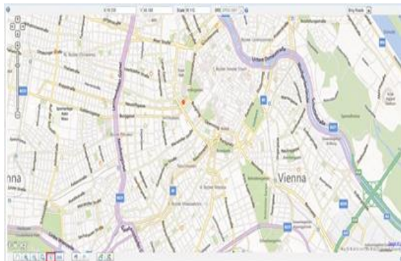
Figure 1: WFS Example