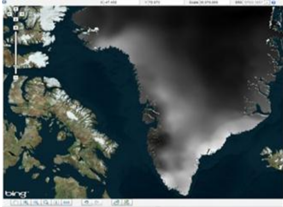
Figure 3: WCS Example