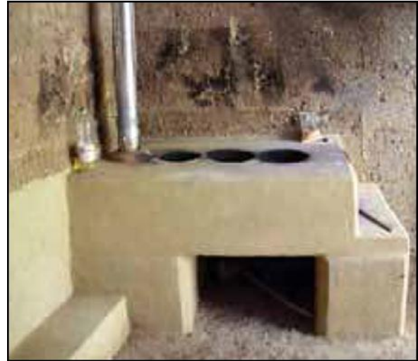
Fig. 1. Chimney installation

Depending on the material, structure and filtering process, chimney filter types are classified into 3 categories.