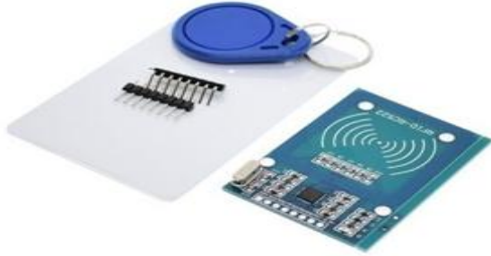
Fig. 3. RFID

4) Buzzer: A buzzer is automatic electromagnetic, electroacoustic, magnetic, electromechanical or piezoelectric auditory gesture device.