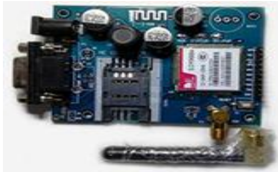
Fig. 4. GSM

5) GSM: GSM stands for Global System for Mobile Communication. It is a digital cellular technology used for transmitting mobile voice and data services.