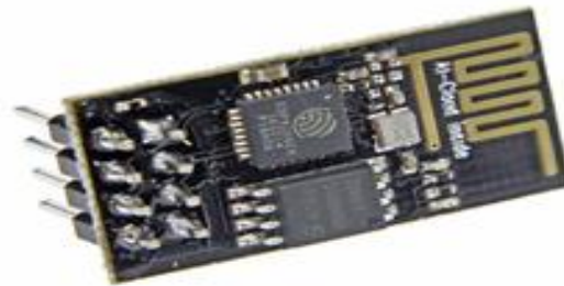
Fig. 2. ESP 8266

2)ESP 8266: ESP8266EX can be applied to any micro- controller design as a Wi-Fi adaptor through SPI/SDIO or UART interfaces. Low-cost WiFi connecting microchip with full TCP/IP stack controller capability. The ESP8266 WiFi Module is a self-contained SOC with integrated TCP/IP protocol stack that can give any microcontroller access to your WiFi network. The ESP8266 is capable of either hosting an application or offloading all Wi-Fi networking functions from another application processor.