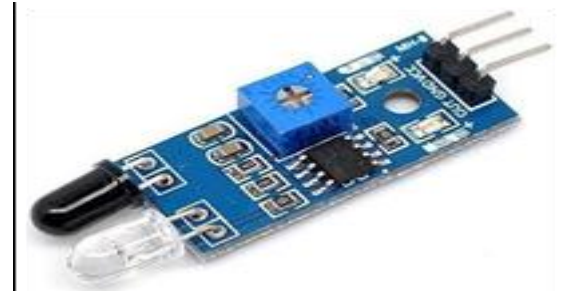
Fig. 1. IR Sensor

receives signal, the potential at the inverting input goes low. The output of the comparator (LM 339) goes high and the LED starts glowing.