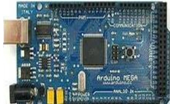
Fig. 2 ARDUINO MEGA microcontroller

Arduino boards carries with it an Atmel 8-bit AVR microcontroller (ATmega8, ATmega168, ATmega328, ATmega1280, ATmega2560) with varying amounts of non-volatile storage, pins, and features. The 32-bit Arduino Due, supported the Atmel SAM3X8E was introduced in 2012. The boards use single or double-row pins or female headers that facilitate connections for programming and incorporation into other circuits. These may connect with add-on modules termed shields. Multiple and possibly stacked shields could also be individually addressable via an I 2 C serial bus. Most boards include a 5 V linear regulator and a 16 MHz crystal. Some designs, like Lily Pad, run at 8 MHz and dispense with the onboard transformer because of specific form-factor restrictions. Arduino microcontrollers are pre-programmed with a boot loader that simplifies uploading of programs to the on-chip non-volatile storage. The default bootloader of the Arduino UNO is that the Opti boot bootloader. Boards are loaded with program code via a serial connection to different computer.