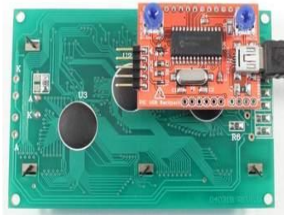
Fig. 5 LCD

supply images in colour or monochrome. LCDs are available to display arbitrary images (as in a general-purpose computer display) or fixed images with low information content, which may be displayed or hidden, like pre-set words, digits, and seven-segment displays, as in a digital clock. They use the identical basic technology, except that arbitrary images are made up of a matrix of small pixels, while other displays have larger elements. LCDs can either be normally on (positive) or off (negative), depending on the polarizer arrangement.