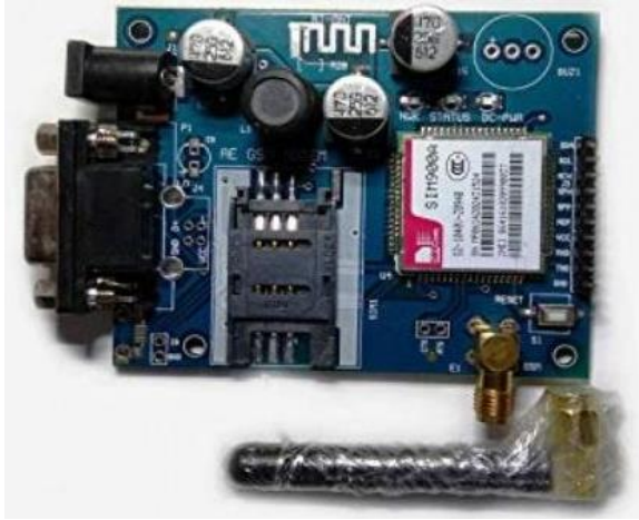
Fig. 3 GSM module