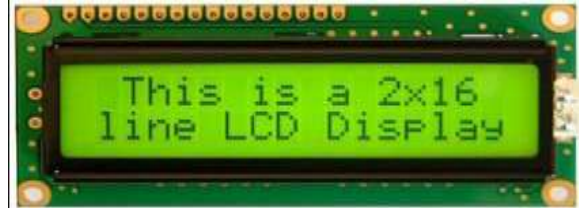
Figure 3.5 LCD display

LCD or liquid crystal display is a 16x2 matrix display which displays alpha numeric characters to provide a visual experience to the user to see any commands, comments, status, observations ETC.