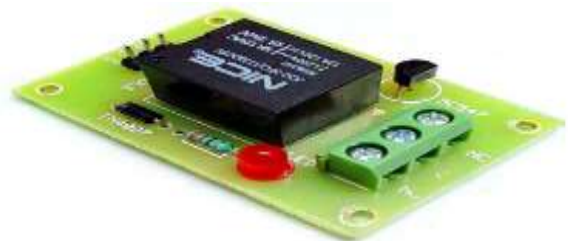
Figure 3.6 Relay module

Relay driver is required to switch the load on either lighting or cooling it works on two method hard switching and soft switching hard switching uses transistor driven relay module and soft switching uses opt coupler driven Relay.