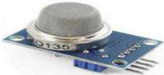
Figure 3.3 DHT 11 sensor

Mq135 is a gas sensor which senses gases such as carbon monoxide smoke/ carbon dioxide, methane natural gas, coal gas ETC, this sensor also has four pins power pins and GPIO'S.