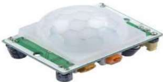
Figure 3.4 occupancy sensor

Occupancy sensor or PIR sensor is used in indoor application in automation and BMS to provide the occupant count. It works on the thermal difference, it has pyro electric sensor which detects the presence humans it is used to control lighting in domestic and industrial purposes.