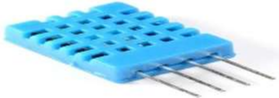
Figure 3.2 DHT 11 sensor

DHT11 is a low cost temperature and humidity sensor works on thermistor mechanism to sense temperature and to measure humidity it uses capacitive humidity sensor DHT11 has 4 pins out of 4 there is one digital and one analog pin.