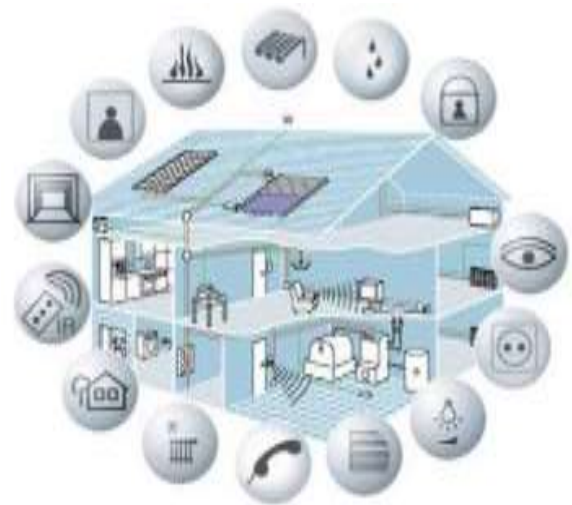
Fig 1.1 connected IOT BMS

Abstract- building management system is a computer controlled mechanical and electrical EQUIPMENT like cooling systems, ventilation, lightings and security unlike home automation the building management system take care of building parameters like HVAC now a days it has a prominent place in industries. BMS provides a recursive approach of updating a data and accordingly adjusting the EQUIPMENT on the basis of the reference maximum provided to the DCS (digital control system). The control mechanism here has been updated and the information of all the sensors data installed to the building is sent to the cloud or any other platform which is used to observe the building condition on regular basis. Power saving and a comfortable environment for the employees inside the building is the major advantage.