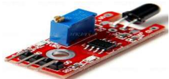
Figure 3.7 flame sensor

Flame sensor is sensitive to normal light it is usually used in fire alarm in BSM is it used for the safety and an alert system during accident it can turned on and turned off using IOT.