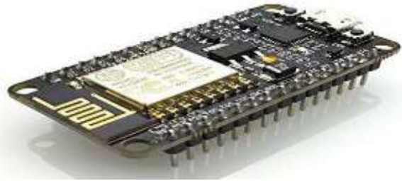
Figure 3.1 NODMECU