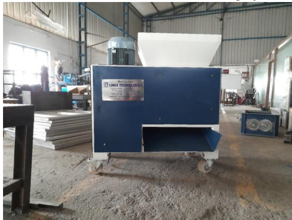
Fabrication of Shredder Machine