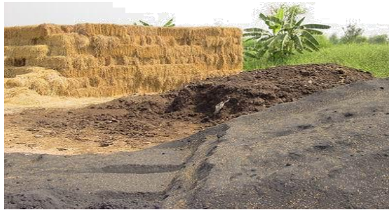
Fig 1: Rice husk ash (R.H.A)

Rice Husk Ash is a Pozzolanic material. It is having different physical & chemical properties. The product obtained from R.H.A. is identified by trade name Silpoz which is much finer than cement.