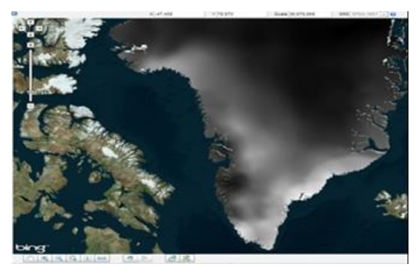
Figure 3: WCS Example