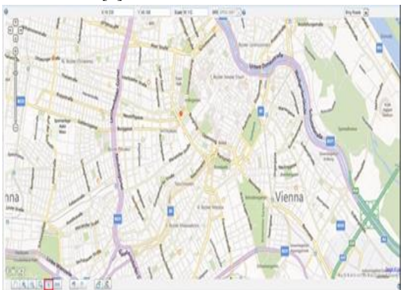
Figure 1: WFS Example