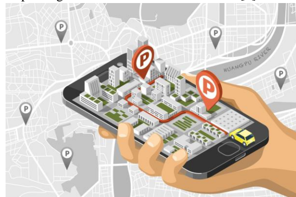
Fig. 1 Application showing parking spots near user

In coming days work, we develop this project which is not just used in a specific stopping region accessible yet can be expanded and furthermore be carried out on different stages, for example, rail line stations, air terminals, shopping center parking spots. We can proficiently administer the parking spots, by dispensing with the need for difficult work [6].