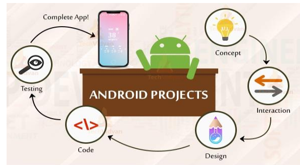
Fig. 3 Front-End Android Concepts

Android Studio is the authority integrated development environment (IDE) for Android Platform Development. Each task in Android Studio contains at least one modules with source code records and asset documents.