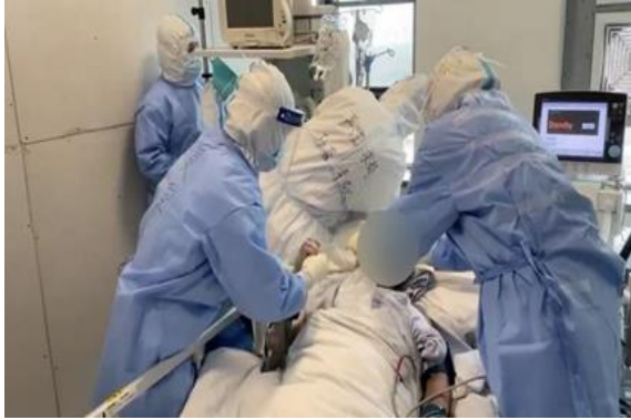
Figure 1: Displaying more of human involvement

A life-threatening illness that occurs when the body is not responding to the infection and is out of balance. It can affect body changes that are more dangerous and may damage multiple organ systems and lead to death. This results with high risk of complications and in-hospital death, longer hospital stays and higher medical costs. Patient vital signs, laboratory results and demographic statistics are risk factors and time consuming. There is no specific alert message for the respective doctors and for the hospital staffs about the ICU, if patient’s temperature or heart rate varies or equipment’s condition changes.