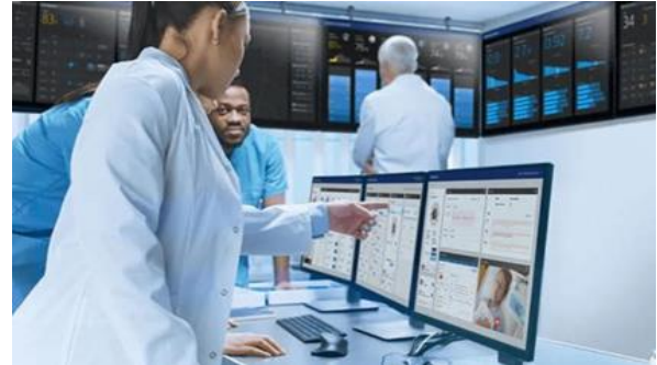
Figure 2: Displaying the advantage of using technology

Given the poor performance of existing severity scores, some new models have been developed for predicting the risk in-hospital death among the ICU patients. Technology plays a major role in our day-to-day life and in today’s time it seems impossible to have a day without techno goods. So, the proposed system is a modern ICU based health monitoring system which acquires the data from sensors and collect all the medical data of a patient including his/her heart rate, body temperature, ICU temperature and equipment’s condition and would send the data to the patient’s doctor regarding his/her full medical information, providing a reliable and fast healthcare service and also able to predict of any failure in system using ML algorithms and IoT hardware. The system consists of a response button which helps to know about the cause of death.