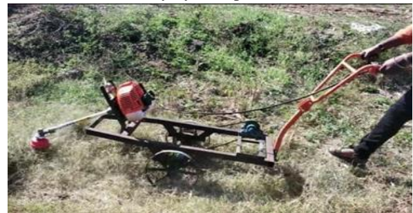
Fig.2 GRASS CUTTING ASSEMBLY

For the operation of grass cutting the grass cutter is attach to the shaft of the clutch housing. Then the switch is on from the accelerator and the engine is start with the help of the starter. During this process power is given to the grass cutter from the engine and driving the machine manually by the operator.