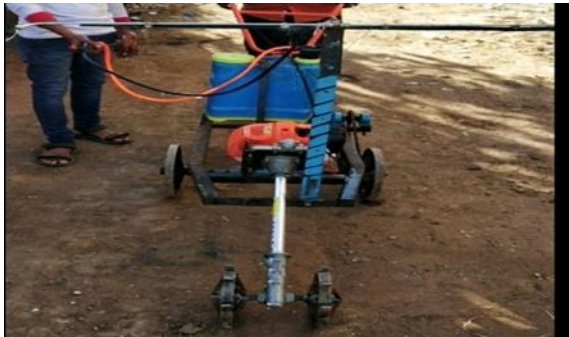
Fig.3 PESTICIDE SPRINKLER ASSEMBLY

During the operation of pesticides sprinkler the machine is drive by the front wheel and the power of the engine is gives to the front wheel with the help of gear head and clutch housing. After starting the engine power is supplied to the front wheel from the engine and the front wheel gates rotates and also the rear wheels gates rotates by the front wheel. And the pesticides box is operate by the chain and gear arrangement. The driver gear is attached with the rear wheel and driven gear is mounted on the frame near pesticides box. When the rear wheels is rotate then the gear are also gets rotate and piston is moves linear direction inside the box during pesticide spraying the rotational motion is converted into linear motion. And spraying operation will be done.