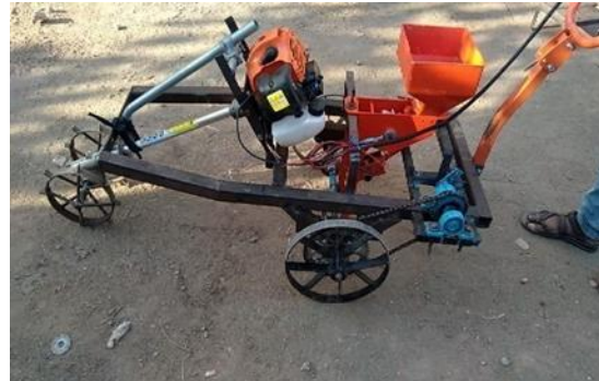
Fig.5 SEED SOWING ASSEMBLY

Then the seed is collected by the floated roller from the one side of the seeder and drops into the hole on the another side of the seeder and then seed is comes into the soil with the help of the pipe connected to the bottom of the hole of the seeder and after seed is come into the soil the seeds are covered by the soil with the help of soil cover which is attach to the bottom of the pipe, Hence the seed sowing operation will be done.