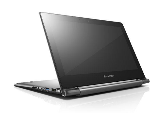
Chrome Book [2]