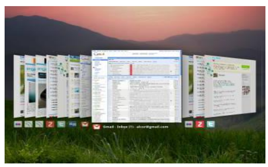
User interface of Google Chrome Operating System[4]