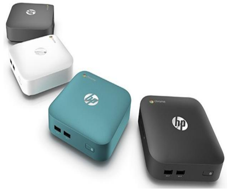
Chrome Box [3]