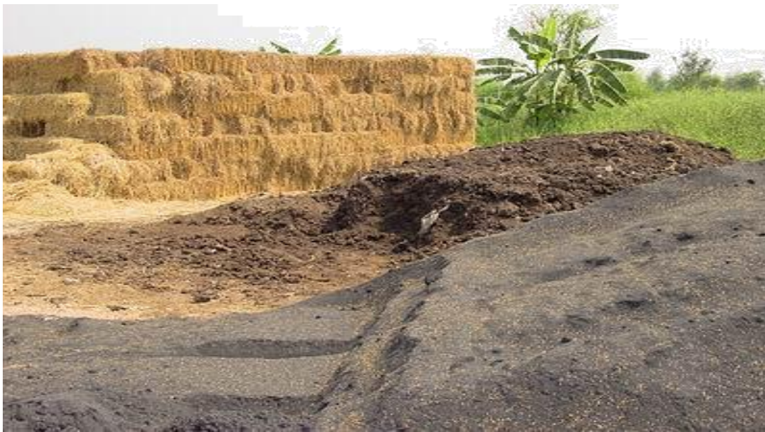
Fig 1: Rice husk ash (R.H.A)

Rice Husk Ash is a Pozzolanic material. It is having different physical & chemical properties. The product obtained from R.H.A. is identified by trade name Silpoz which is much finer than cement.