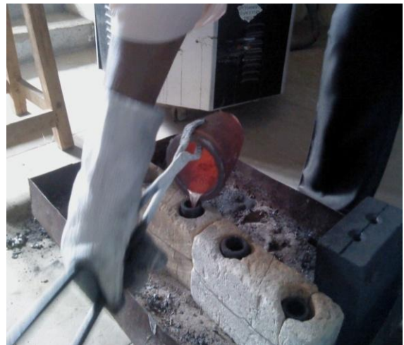
Fig 4 .Casting Mould

AlP and Si are both diamond cubic with very similar lattice parameters (0.356 nm for silicon, 0.357 nm for AlP). When P is added into the melt of hypereutectic Al-Si alloys, the reaction Al+P \rightarrow AlP takes place in the modification. AlP can act as the inhomogeneous nucleus of primary silicon