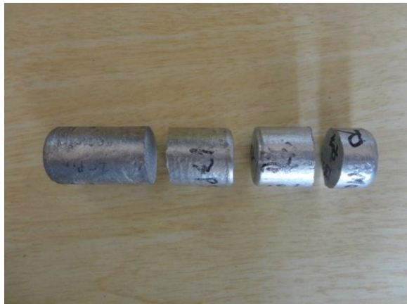
Fig3 .Hardness Specimen