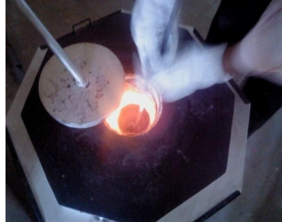
Fig 2 Casting furnace