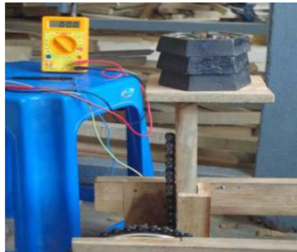
Fig.- 6 Testing of O/P power

The output of the model is intermittent and is obtained as each vehicle runs over the speed breaker and thus the power developed depends directly on the frequency of the