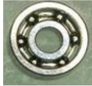
Fig.-3 Ball bearing