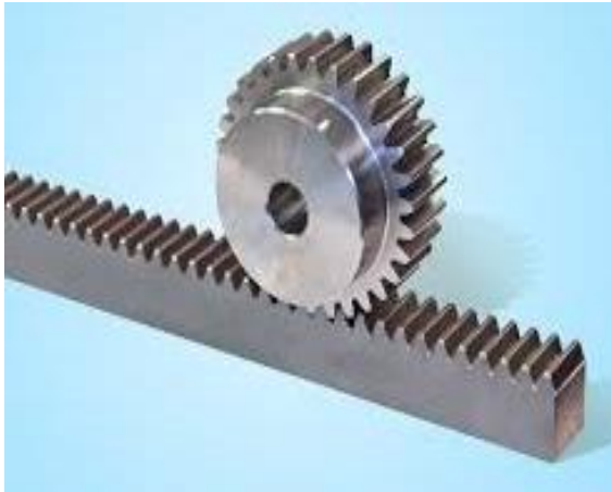
Fig.-2 Rack-Pinion Working

A rack and pinion is a type of straight actuator that comprises a pair of accoutrements which convert rotational motion into linear shift. A circular gear called "the pinion" engross teeth on a linear "gear" bar called "the rack"; rotational motion applied to the pinion causes the rack to move relative to the pinion, thereby translating the rotational motion of the pinion into linear motion.