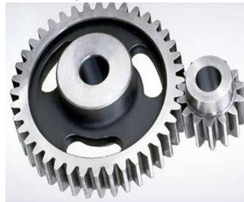
Fig.-4 Spur gearing