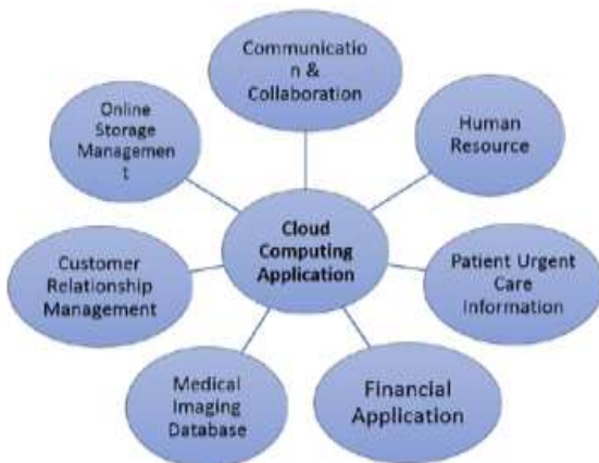
Figure: 1.3 Applications of Cloud Computing.

Applications of cloud computing is very vast. The application of cloud is limitless. It provides the virtual way to store the data and other information. There is no area where cloud computing not shows its miracle. Figure: 1.3 represents all the possible application where cloud computing gives his contribution.