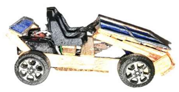
IV. DATA ANALYSIS