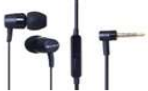
Fig 4: Earphone (3.5mm phone jack)

Headphones are a pair of small loudspeaker drivers worn on or around the head over a user's ears. They are electro acoustic transducers, which convert an electrical signal to a corresponding sound. Headphones let a single user listen to an audio source privately, in contrast to a loudspeaker, which emits sound into the open air for anyone nearby to hear. Headphones are also known as ear speakers, earphones or, colloquially, cans. Circum aural ('around the ear') and supra-aural ('over the ear') headphones use a band over the top of the head to hold the speakers in place. Headphones connect to a signal source such as an audio amplifier, radio, CD player, portable media player, mobile phone, video game console, or electronic musical instrument, either directly using a cord, or using wireless technology such as Bluetooth, DECT or FM radio. The first headphones were developed in the late 19th century for use by telephone operators, to keep their hands free. Initially the audio quality was mediocre and a step forward was the invention of high fidelity headphones.