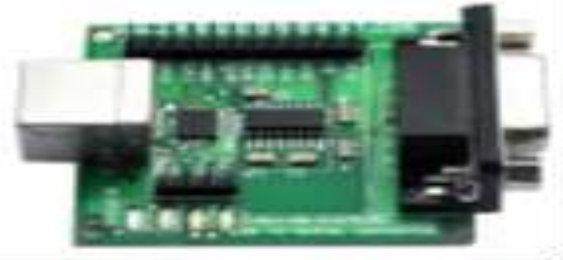
Fig 1: CP2102 Serial to USB Converter Board

It is the small size USB serial module [19]. It is designed as per convenience of user. User can interface devices or modules which supports the UART (Universal Asynchronous Receiver and Transmitter) with the laptops or PCs through USB or serial port. This module comprises of standard USB type-B connector in order to reduce the size of the module. It provides platform for adding a serial or USB interface to product designs which are already existing. MAX232 IC behaves as transition stage between RS232 (Recommended Standard 232) and TTL (Transistor-Transistor Logic) voltage levels. Receivers (Rx) pin of MAX232 convert from RS-232 to TTL voltage levels and driver pin (Tx) converts from TTL logic to RS-232 voltage levels. Similarly, CP2102 is transition stage in between USB and TTL voltage levels which allows data to be read or write through USB port.