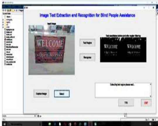
Fig.5: Snapshot of Experimental Result

To evaluate the effectiveness or efficiency of our proposed system, we apply this algorithm on various captured images. We have collected images of book covers, product labels, natural scene images, documents etc. Logitech C207 HD web camera with autofocus is connected to laptop with the help of USB connection. Figure 5.1 shows snapshot of experimental system.