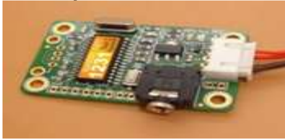
Fig 2: TTS Module

In this paper has introduced an innovative, efficient and real-time cost beneficial technique that enables user to hear the contents of text images instead of reading through them. It combines the concept of Optical Character Recognition (OCR) and Text to Speech Synthesizer (TTS). This kind of system helps visually impaired people to interact with computers effectively through vocal interface. Text Extraction from color images is a challenging task in computer vision. Text-to-Speech conversion is a method that scans and reads English alphabets and numbers that are in the image using OCR technique and changing it to voices. This paper describes the design, implementation and experimental results of the device. This device consists of two modules, image processing module and voice processing module. The device was developed based on Raspberry Pi v2 with 900 MHz processor speed