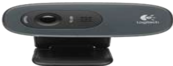
Fig 3: Logitech HD C207 Web Camera

A webcam is a video camera that feeds or streams its image in real time to or through a computer to a computer network. When "captured" by the computer, the video stream may be saved, viewed or sent on to other networks travelling through systems such as the internet, and e-mailed as an attachment. When sent to a remote location, the video stream may be saved, viewed or on sent there. Unlike an IP camera which connects using Ethernet or Wi-Fi, a webcam is generally connected by a USB cable, or similar cable, or built into computer hardware, such as laptops