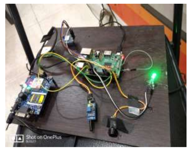
Figure 2: Model of female safety kit

Figure 1 : Block diagram of the female safety Kit At the same time GPS will record the current location and the system will forward the location in the form of an SMS to the registered number.