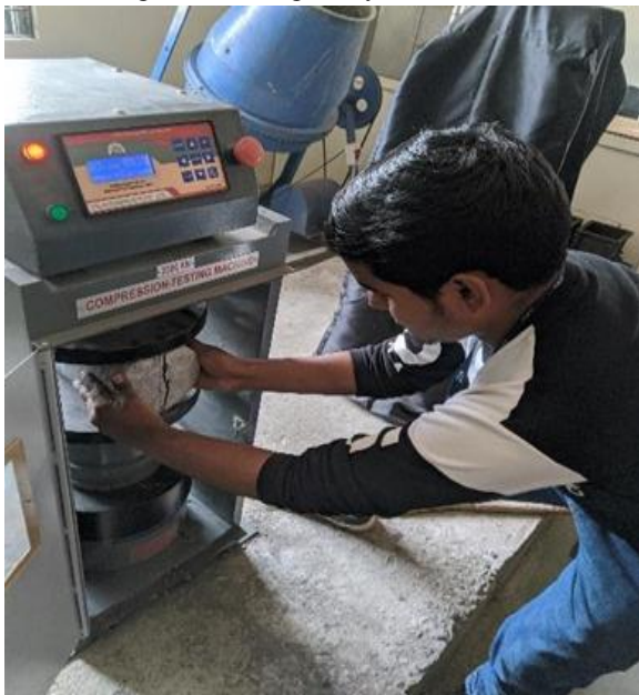
Figure 5. Placing and testing of cylinder for split tensile test