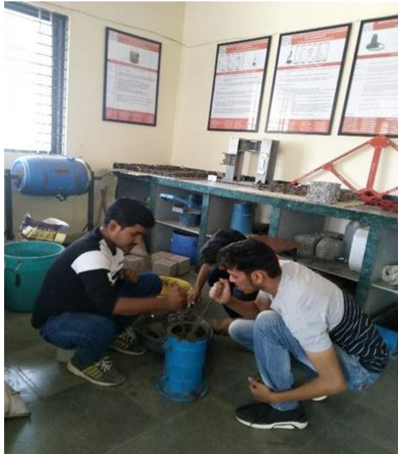
Figure 4. Filling of Cylinder Mould