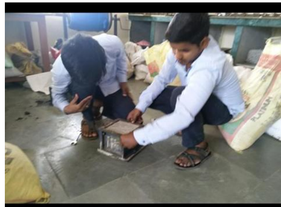
Figure 2. Demoulding the specimens