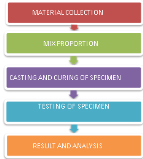
Figure 1. Flow Chart for Experimental work

The various journals were collected and studied on the partial replacement of the fine aggregate by different materials. According to these journals the process of the experiment and the method of the experimentation and the different tests conducted in those journals were studied and learned. On the basis of the studies of the journals collected for the experiment the experimental methodology for the project was choose.