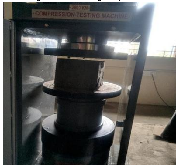
Figure 3. Compressive Testing of cube in Machine