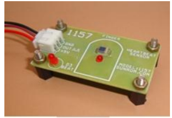
Figure 2: Heart Beat Sensor

Heart beat sensor is designed to give output of heart beat when a finger is placed on sensor. It starts working when LED on top side will starts blinking with each heart beat. To see the sensor output, output pin of sensor is connected to FPGA. The heartbeat sensor used here works on the principle of light modulation. It measures the change in volume of blood through any organ of body which causes a change in the light intensity through that organ. The flow of blood volume is decided by the rate of heart pulses. Heartbeat sensor is used to give digital output of heartbeat when finger is placed on it.