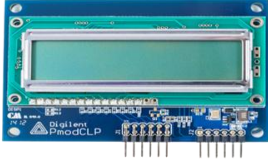
Figure 4: Pmod CLP

controller to display information. The module can execute a variety of instructions, such as erasing specific characters, setting different display modes, scrolling, and displaying user-defined characters. Here Pmod CLP will display temperature and Heart rate.