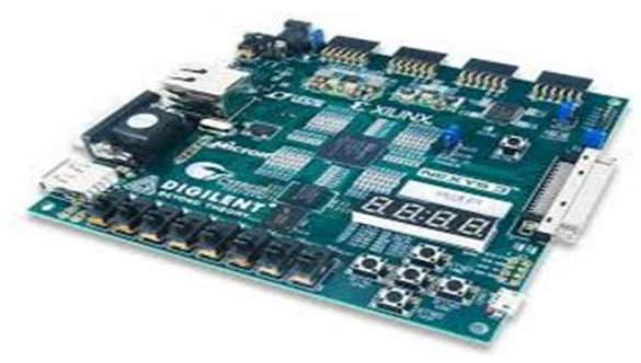
Figure 5: FPGA

System is coded by using VHDL this code is dumped in FPGA development kit by using Xilinx ISE tools The key advantage of VHDL is that it allows the behavior of the required system to be described and verified before synthesis tools translate the design into real hardware. VHDL is a dataflow language in which every statement is considered for execution simultaneously.