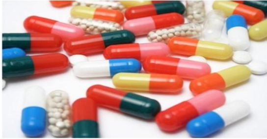
Figure 2. Capsules

There is another route of administration of drug which includes parenterals. These are sterile preparations which contains drug in the form of ampoules or vials. These injections can be intravenous (to vein) intramuscular (to muscle) or subcutaneous (to skin). Inhaler is also used for asthma patients. Nebulizer is used for reducing blockage in the nostrils for small children [21-40].