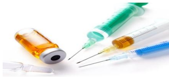
Figure 4. Injections

Disadvantages of solid dosage forms include