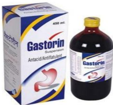
Figure 3. Syrup: A liquid form