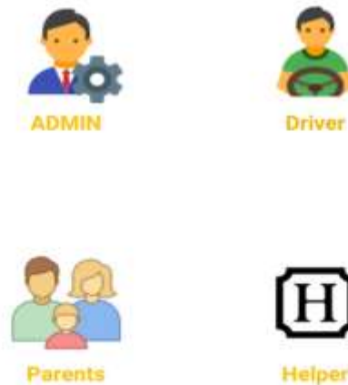
Figure 3: Showing all the users