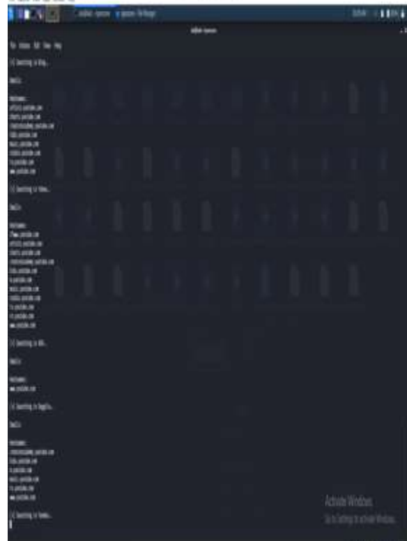
Fig.6: Searching in Bing