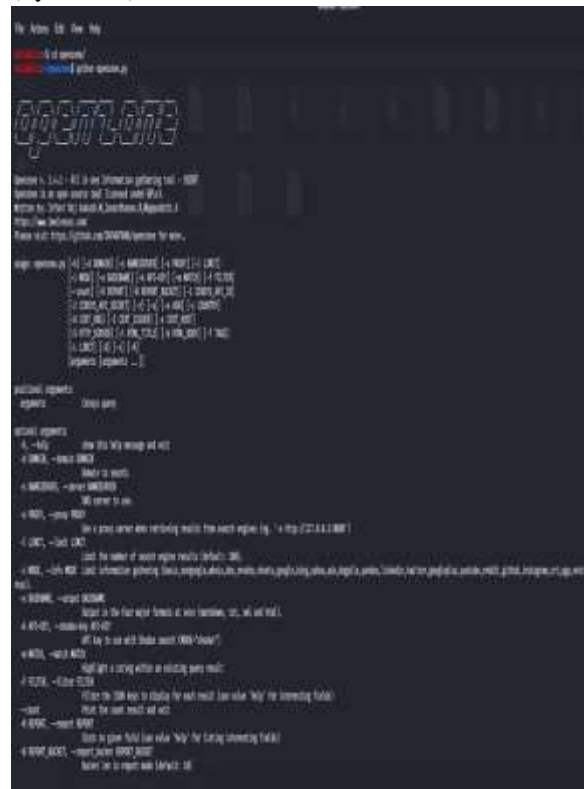
Fig.2:Layout of Openzone

Dependencies: sudo pip install -r requirements.txt (Python2.7)