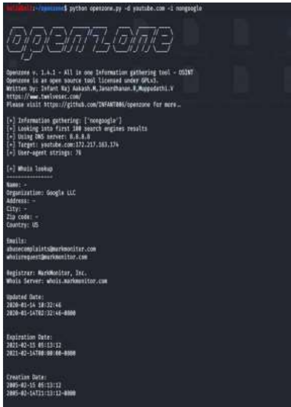
Fig.4:Search engine results