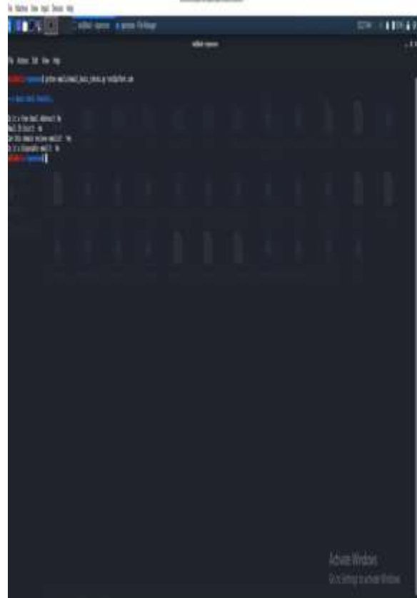
Fig.5: Searching Process