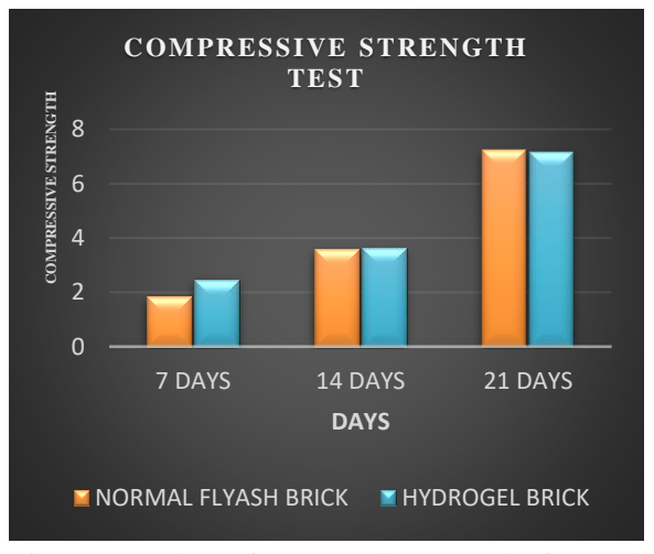
Fig.6 Comparison of Compressive strength of normal fly ash brick VS cooling brick

Table.6 Compressive strength of Normal fly ash bricks