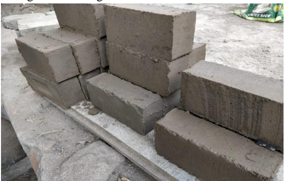
Fig.5 Cooling Brick

increase in density irrespective of lime content, type of curing and molding water content.