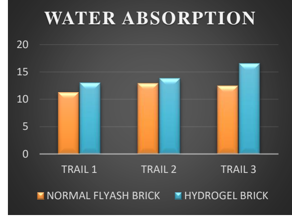
Fig.7 Water absorption of normal fly ash brick VS cooling brick

Table.8 Water absorption of Normal fly ash brick