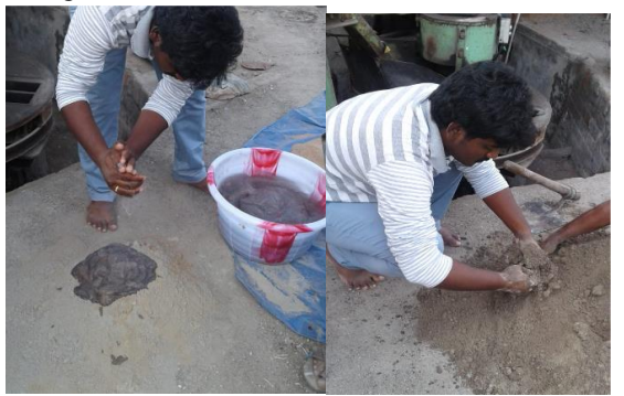
Fig. 2&3 Mixing

Mixing is a very important process; the uniform mixing will make the bricks in a uniform property and strength.