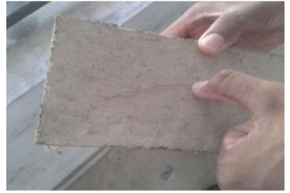
Fig.8 Hardness test

Hardness Test is a simple test. A good brick is more resistance to abrasion. Sharp object scratches the surface of bricks and if there is no impression on brick then it's a Hard Brick. The hardness of brick can be judged with the help of the scratch of the fingernail. Try to scratch figure on brick, if no scratch is left on the surface of the brick, it is considered to be having sufficient hardness.