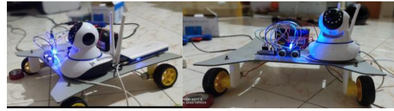
Fig 2: Working model of the Rover

The above images show the working model of the rover. The rover contains basic automation controls as well as manual controls augmented for the movement. The Wi-Fi camera provides constant feedback of the imaging of the surroundings of the rover, which helps in the manual control of the rover. The laser circuit detects obstacles in the path of the rover and makes any necessary corrections to the movement path based on its feedback.