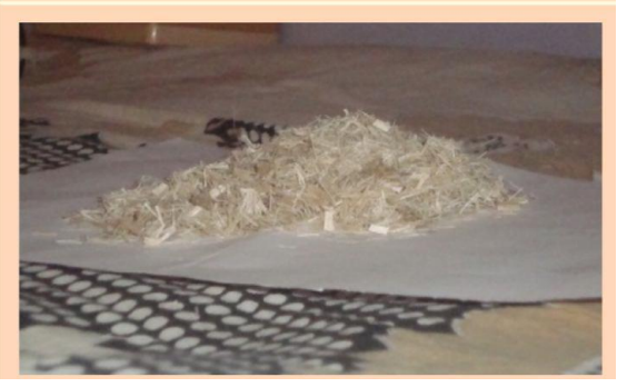
Fig 3: BANANA FIBRE

These fibres are extracted from the banana stem. The availabilities of this fibre from banana stem are 5 to 10%. The use of banana stem is very useful to produce paper, yarn, fabrics etc.