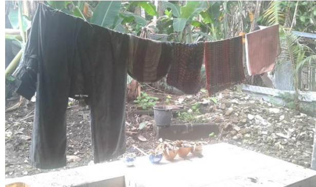
Fig. 3: The experimental set up (S-3) showing the garments dried under the heat of the sun without using of the drying chamber, electric fan, solar panel and electric iron.

Set up 3 (S-3) is a control set up in which the clothes were dried in a typical way by drying under the heat of the sun without using the chamber, electric fan, solar panel and electric iron (See Figure 3).