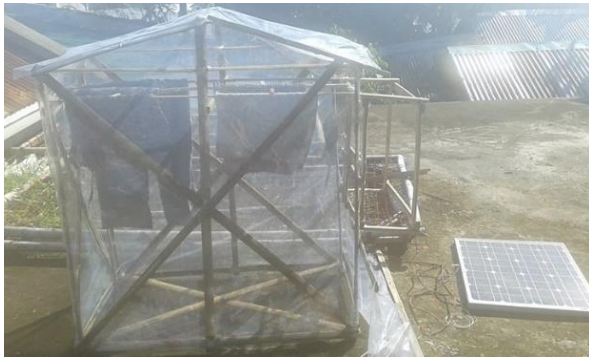
Fig. 1: The experimental set up (S-1) showing the drying chamber, electric fan, washed clothes and the solar panel

wall of the drying chamber is made of plastic to trap the heat of the sunlight that enter the chamber. The length of the chamber is 1.05 meters, width is 0.50 meters, height of the body is 1.10 meter but with roof included the height is 1.28 meters. It is inside the chamber where wet clothing was dried. On the first set up (S-1), an electric fan with frame made up of bamboo is attached on the chamber with the purpose that the hot air trapped on the chamber would continuously circulate around the wet clothing. The motor of the electric fan is 12 volts and 18 watts (See Figure 1).