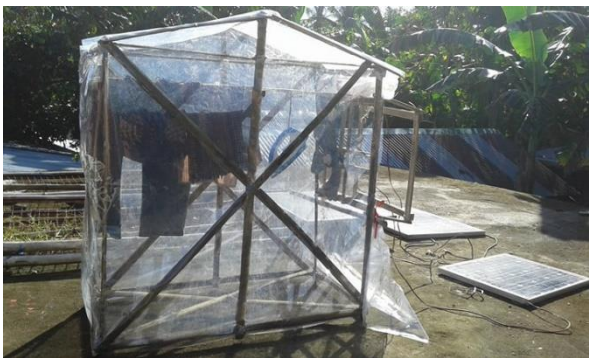
Fig. 2: The experimental set up (S-2) showing the drying chamber, electric fan, washed clothes and the solar panel

On the second set up (S-2), an electric flat iron was attached in front of the electric fan to amplify the heat. With the electric fan, hot air would continuously circulate inside the chamber. The electric flat iron is 12 volts and 150 watts. The electric flat iron is connected directly to 200 watts solar panel while the electric fan was connected directly to a 50 watts solar panel (See Figure 2).