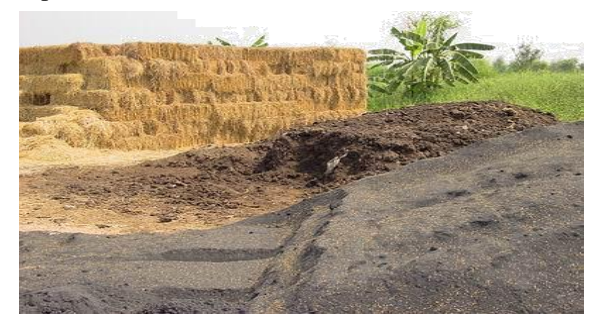
Fig 1: Rice husk ash (R.H.A) Table 1: Physical Properties of R.H.A

Rice Husk Ash is a Pozzolanic material. It is having different physical & chemical properties. The product obtained from R.H.A. is identified by trade name Silpoz which is much finer than cement.