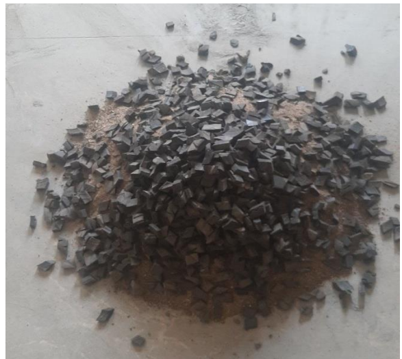
Figure 3: Uniform Distribution of Shredded Tyre