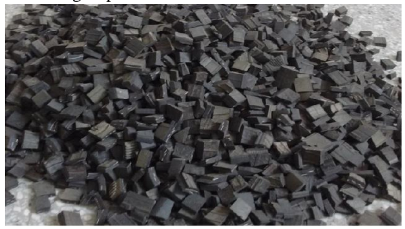
Figure 1: Shredded Tyre

A total of 39 concrete specimens were prepared and tested in the experimental program having the size of 150mm×150mm×150mm. M20 grade of concrete has been used as per the requirement for axial load design. Each cube specimen consists of a 150 mm square cross section and a depth of 150 mm. 9 plain concrete specimens (no replacement) were prepared and 27 shredded tyre used concrete with different percentage of replacement were prepared. These specimens were prepared for 7, 14 and 28 days of curing respectively. The specimens were numbered as PC_{11} , TC_{11} , TC_{12} and so on, where the letter "P" indicates Plain, and "T" and "C" are indicating waste Tyre and Concrete respectively. "C" indicates concrete which is the second word in abbreviation and the numeric value indicates the sequence in which they were tested in different group.