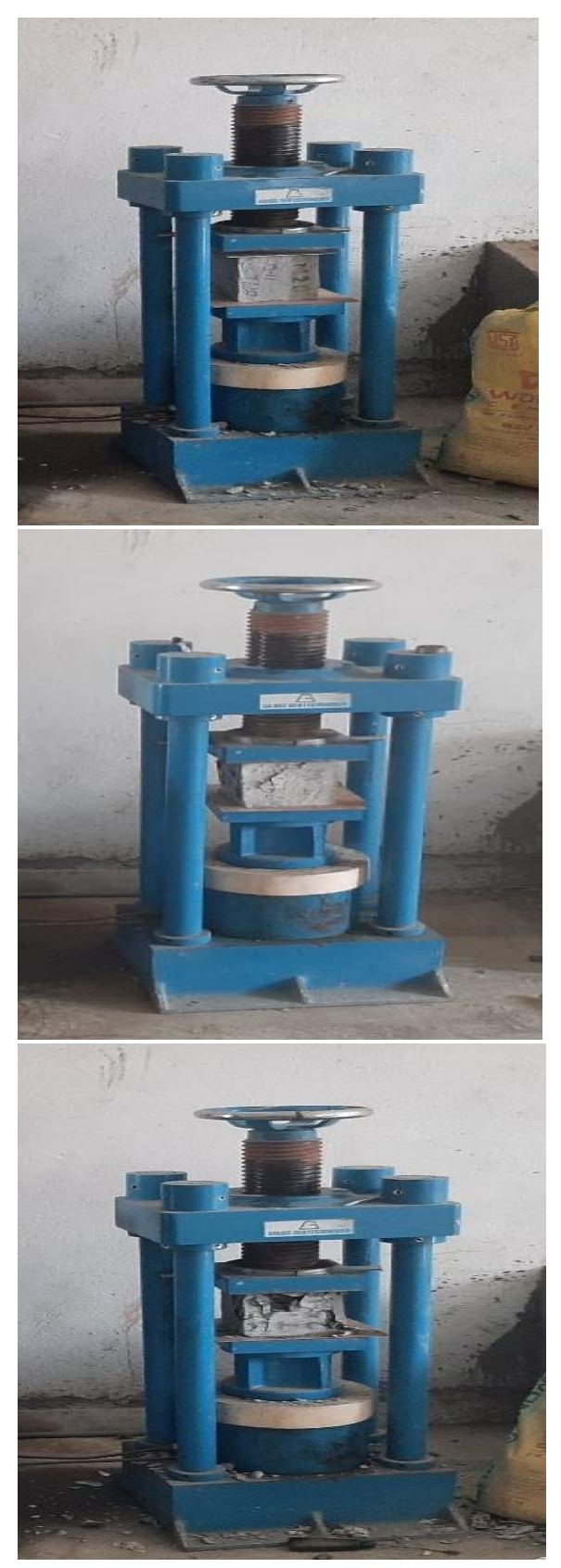
Figure 4: Arrangement & Failure of Specimen

These specimens were subjected to axial compressive load using compressive testing machine of 2000KN capacity. The surface area of each specimen was 22500mm<sup>2</sup>. Ultimate load readings were taken to study the compression performance of the specimens. Prior to testing, all specimens were wiped off the water by a cloth and cleaned the surfaces of concrete and leave them at the room temperature for drying. After all these actions, putting the specimen by possessed a thick layer of paper fixed at the top and bottom surface of the column in order to ensure that the contact surface remained parallel and that the applied load remained concentric. The results of tested specimens were tabulated below, these results were recorded in ultimate loads at which the failures of specimens occurred and further these loads are converted in ultimate stress that is ultimate load divided by cross sectional (surface area) area in which the load was applied.