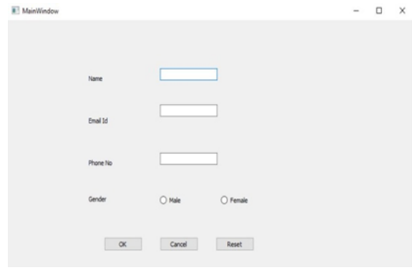
Figure 1 Registration page