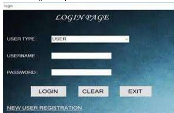
Fig 2: Login page for admin

Admin can log in to the system selecting the user type and entering the required details.