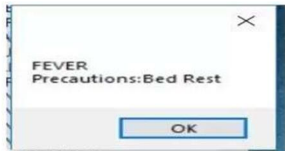
Fig 4: Prediction result for disease

The results are calculated by the model based on the rule set will be shown here.