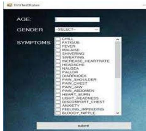
Fig 3: Symptom selection form for user

The user will have to select the symptoms here.