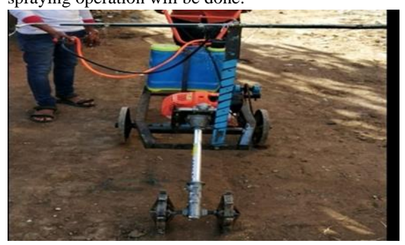
Fig.3 PESTICIDE SPRINKLER ASSEMBLY

During the operation of pesticides sprinkler the machine is drive by the front wheel and the power of the engine is gives to the front wheel with the help of gear head and clutch housing. After starting the engine power is supplied to the front wheel from the engine and the front wheel gates rotates and also the rear wheels gates rotes by the front wheel. And the pesticides box is operate by the chain and gear arrangement. The driver gear is attached with the rear wheel and driven gear is mounted on the frame near pesticides box. When the rear wheels is rotate then the gear are also gets rotate and piston is moves linear direction inside the box during pesticide spraying the rotational motion is converted into linear motion. And spraying operation will be done.