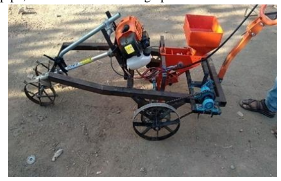
Fig.5 SEED SOWING ASSEMBLY

Then the seed is collected by the floated roller from the one side of the seeder and drops into the hole on the another side of the seeder and then seed is comes into the soil with the help of the pipe connected to the bottom of the hole of the seeder and after seed is come into the soil the seeds are covered by the soil with the help of soil cover which is attach to the bottom of the pipe, Hence the seed sowing operation will be done.