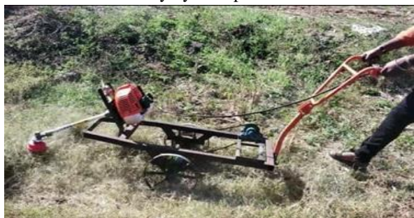
Fig.2 GRASS CUTTING ASSEMBLY

For the operation of grass cutting the grass cutter is attach to the shaft of the clutch housing. Then the switch is on from the accelerator and the engine is start with the help of the starter. During this process power is given to the grass cutter from the engine and driving the machine manually by the operator.