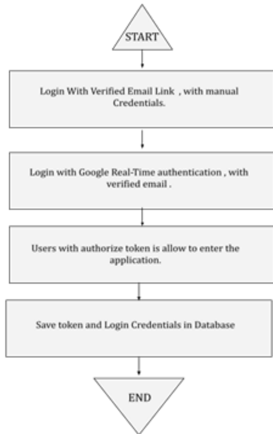
Fig.3.2.1 System Security

The approval calculation token is executed at whatever point managing delicate information like passwords, carrier token, approval, and so on. It is the cycle where individuals who attempt to login with no Token then the framework gives a blunder and tell the client is unapproved and leave the framework.