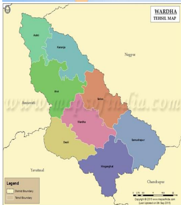
Map.1. India showing Maharashtra state. Map.2. Vidharbha District showing tehsils.